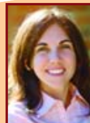
Health from the Inside Out

I hope these tips give you the tools to turn out some great treats!